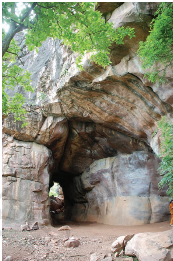
Cave entrance, Bhimbetka, Madhya Pradesh

The paintings of the Upper Palaeolithic phase are linear representations, in green and dark red, of huge animal figures, such as bisons, elephants, tigers, rhinos and boars besides stick-like human figures. A few are wash paintings but mostly they are filled with