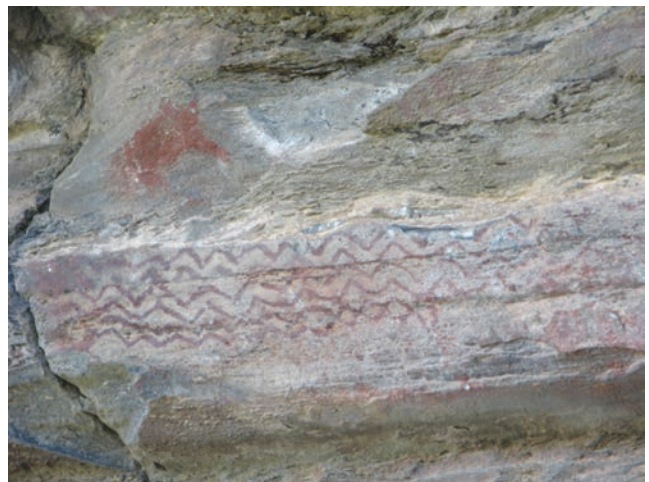
Wavy lines, Lakhudiyar, Uttarakhand