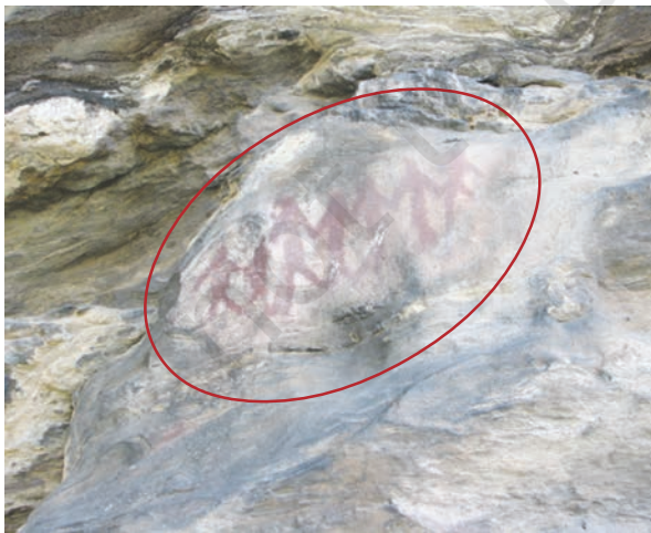
Hand-linked dancing figures, Lakhudiyar, Uttarakhand

Remnants of rock paintings have been found on the walls of the caves situated in several districts of Madhya Pradesh, Uttar Pradesh, Andhra Pradesh, Karnataka and Bihar. Some paintings have been reported from the Kumaon hills in Uttarakhand also. The rock shelters on banks of the River Suyal at Lakhudiyar, about twenty kilometres on the Almora–Barechana road, bear these prehistoric paintings. Lakhudiyar literally means one lakh caves. The paintings here can be divided into three categories: man, animal and geometric patterns in white, black and red ochre. Humans are represented in stick-like forms. A long-snouted animal, a fox and a multiple legged lizard are the main animal motifs. Wavy lines, rectangle-filled geometric designs, and groups of dots can also be seen here. One of the interesting scenes depicted here is of hand-linked dancing human figures. There is some superimposition of paintings. The earliest are in black; over these are red ochre paintings and the last group comprises white paintings. From Kashmir two slabs with engravings have been reported. The granite rocks of Karnataka and Andhra Pradesh provided suitable canvases to the Neolithic man for his paintings. There are several such sites but more famous among them are Kupgallu, Piklihal and Tekkalkota. Three types of paintings have been reported from here—paintings in white, paintings in red ochre over a white background and paintings in red ochre. These