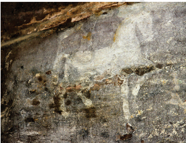
One of the few images showing only one animal, Bhimbetka

The artists of Bhimbetka used many colours, including various shades of white, yellow, orange, red ochre, purple, brown, green and black. But white and red were their favourite colours. The paints were made by grinding various rocks and minerals. They got red from haematite (known as geru in India). The green came from a green variety of a stone called chalcedony. White might have been