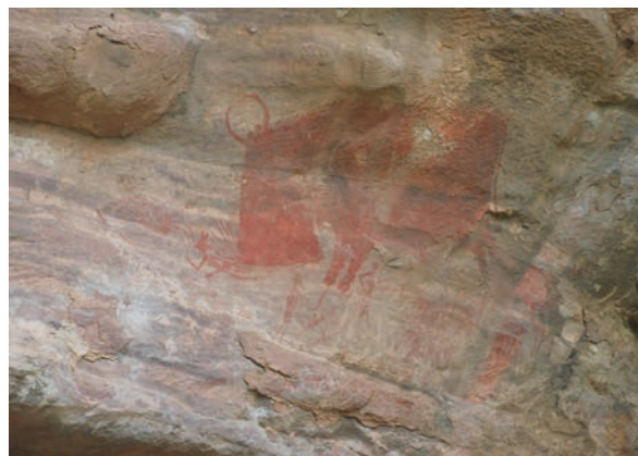
Painting showing a man being hunted by a beast, Bhimbetka

made out of limestone. The rock of mineral was first ground into a powder. This may then have been mixed with water and also with some thick or sticky substance such as animal fat or gum or resin from trees. Brushes were made of plant fibre. What is amazing is that these colours have survived thousands of years of adverse weather conditions. It is believed that the colours have remained intact because of the chemical reaction of the oxide present on the surface of the rocks.